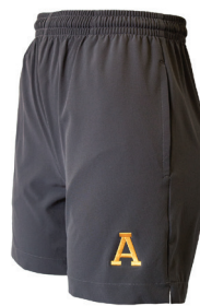
Sport Short Unisex