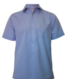
Shirt Short Sleeve