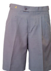
Shorts Pleated Silver Grey