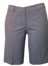
Shorts Tailored Silver Grey