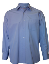
Long Sleeve Shirt