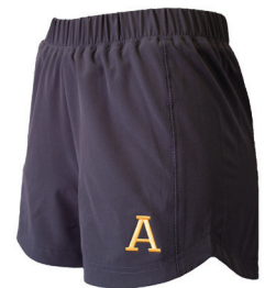
Sport Short Girls