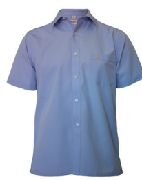
Shirt Short Sleeve