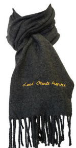
Scarf with emb

For current prices, please refer to www.bobstewart.com.au