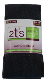
Tights Dk Grey Cotton