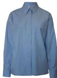
Blouse Long Sleeve