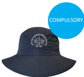
Hybrid Bucket Hat