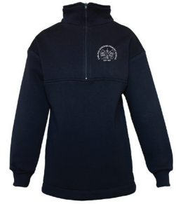
Qtr Zip Top