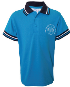
Polo short sleeve