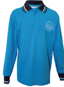
Polo long sleeve