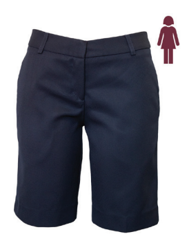
Shorts Tailored Navy