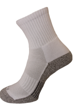
Sport Socks 2 pkt