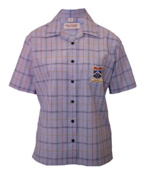
Blouse Short Sleeve