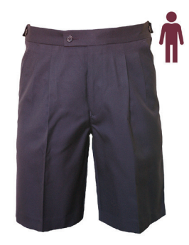
Shorts Pleated Navy