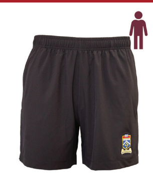
Sport Shorts Unisex