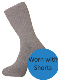
Short Walk Socks 2pk