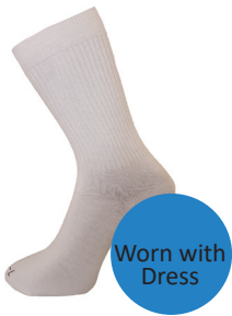
Socks Anklet 2pk