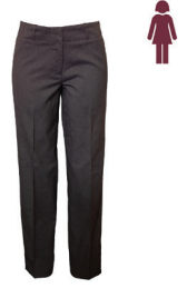
Pants Tailored Grey Melange