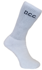
Sports Sock Crew