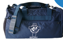
Olympic Sports Bag