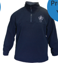
Polar Fleece 1/4 Zip Top