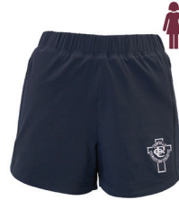
Sport Shorts with inner