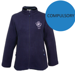
Polar Fleece Jacket Full Zip