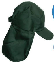
Legionnaires Cap Bottle Green