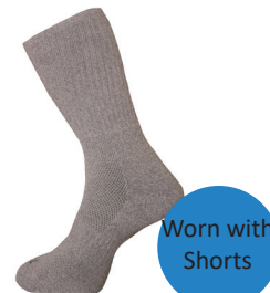
Short Walk Socks 2pk