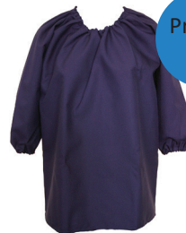
Donvale Art Smock