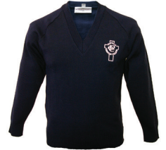
Pullover Senior Navy Year 10 - 12