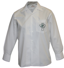
Shirt Long Sleeve