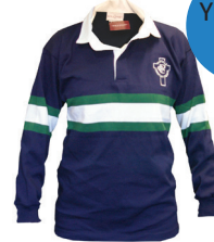
Rugby Top Senior