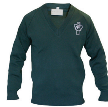
Pullover Green Year 7 - 9