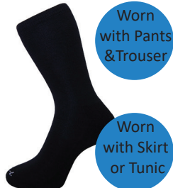
Socks Crew Black 3 pk