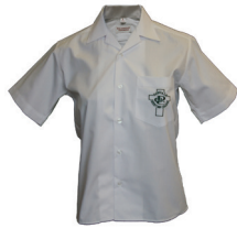
Unisex Shirt Short Sleeve