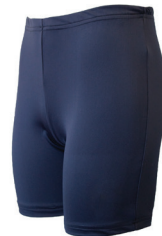
Jammers Boys Navy