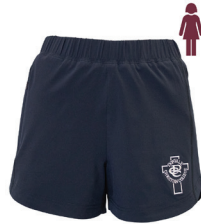
Sport Shorts with inner