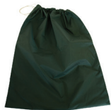
Library Bag Green