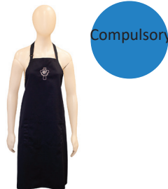
Apron - Food Studies