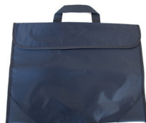
Library Folio Navy