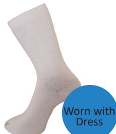
Socks Ankle 2pk