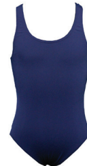
Bathers Girls Navy