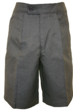
Unisex Shorts w/elastic Dark Grey