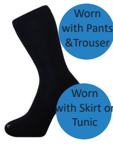
Socks Crew Black 3 pk