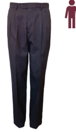
Trousers Grey Melange