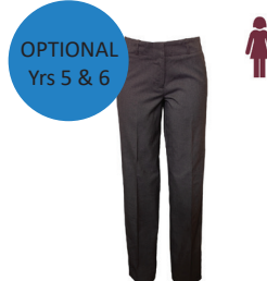
Pants Tailored Grey Melange