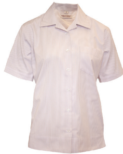
Blouse Short Sleeve