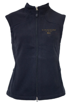
ELC Polar Fleece Vest