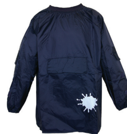
Art Smock Navy