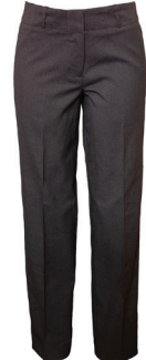
Tailored Pant Grey Melange