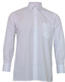
Shirt Long Sleeve