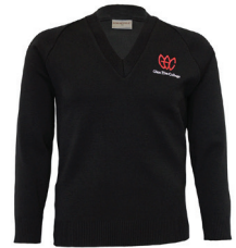
Pullover - Optional