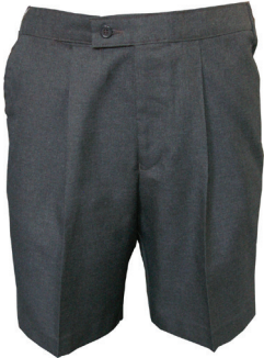
Shorts pleat front Dark Grey