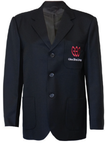
Blazer - Optional