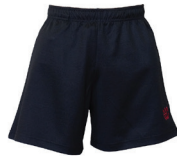
Sport Short short leg