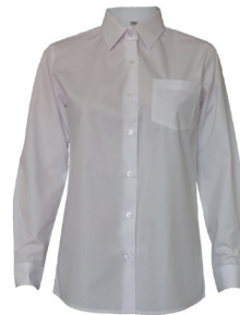
Blouse Long Sleeve