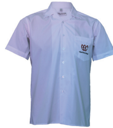
Shirt Short Sleeve