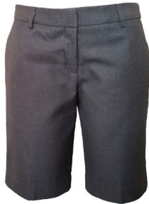
Shorts Tailored Dark Grey