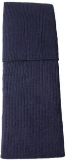
Navy Wool Kneehigh Sock