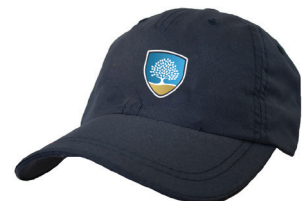
Cap - Senior

For current prices, please refer to www.bobstewart.com.au