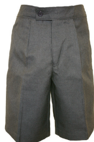
Dark Grey Shorts Primary fly front with elastic back