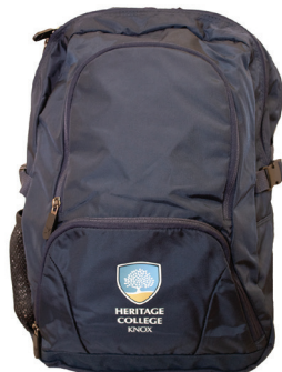
School Backpack Senior