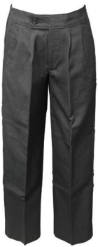
Dark Grey Trousers double knee