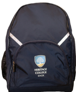
School Backpack Junior