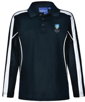
Sports Polo Long Sleeve