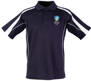
Sports Polo Short Sleeve