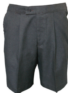
Dark Grey Senior Shorts