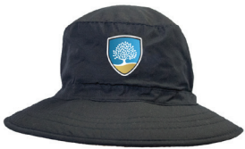
Hat - Junior