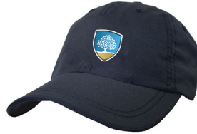
Cap - Senior