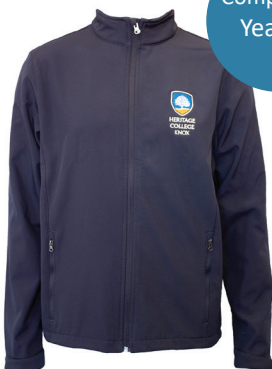
Soft Shell Jacket