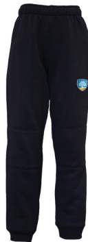
Trackpants Doubleknee with crest