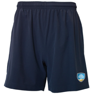
Navy Sport Shorts with crest