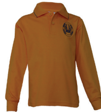
Polo Long Sleeve