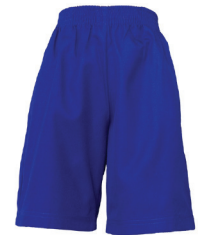
Shorts Gabardine Pull On