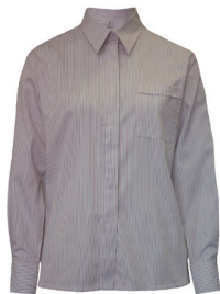
Blouse Long Sleeve