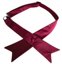
Cross Over Tie