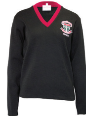
Pullover Yr 12