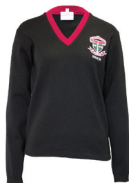
Pullover Yr 12