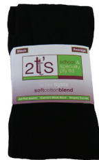
Tights Black Cotton