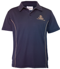
Polo Short Sleeve