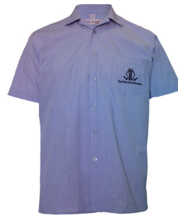
Shirt Short Sleeve