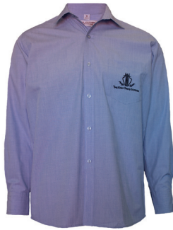
Shirt Long Sleeve