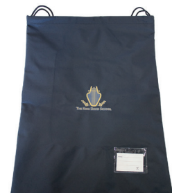
Library Bag Prep-Yr2