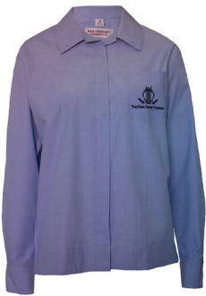
Blouse Long Sleeve