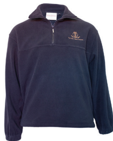
Polar Fleece Top