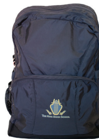
Chiropak Yr7 - Yr12