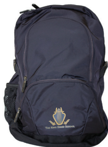
Airopak Yr3 - Yr6