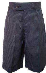
Shorts elastic back