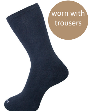
Socks Navy 3 pk