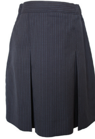
Winter Skirt Junior