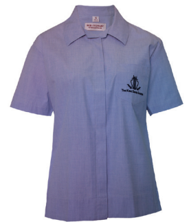
Blouse Short Sleeve