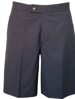
Shorts Senior fly front