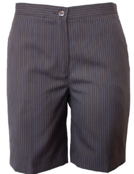
Shorts Tailored flat front