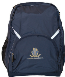
Unopak Prep - Yr2