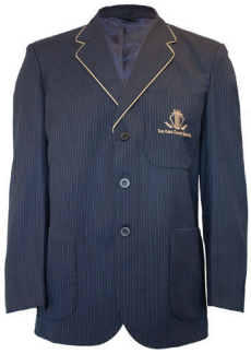
Blazer - Yrs 10 - 12