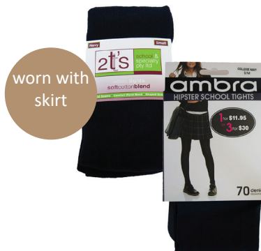
Tights Navy cotton or opaque