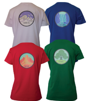
House Top Assort.