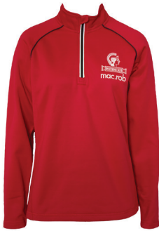
Quarter Zip Top