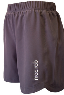
Sport shorts with inner