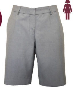
Shorts Tailored Silver Grey