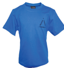
House T Shirt Blue