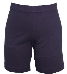
Bike Shorts Navy