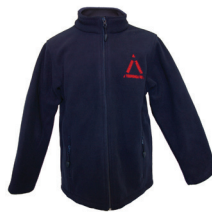
Polar Fleece Jkt