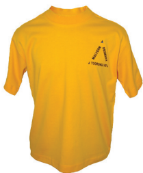
House T Shirt Gold