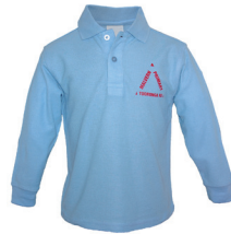
Polo Long Sleeve