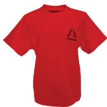
House T Shirt Red