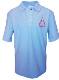
Polo Short Sleeve