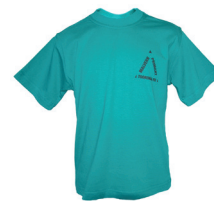
House T Shirt Green