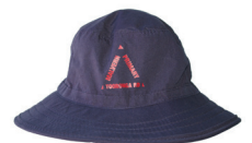
Hat with crest