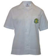
Blouse Short sleeve