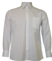
Shirt Long Sleeve