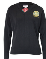
Pullover Yr 10 - 12