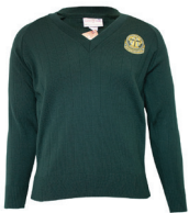
Pullover Yrs 7 - 9