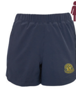
Sport Short Girls with inner