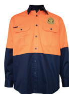
Hi-Vis Drill Shirt