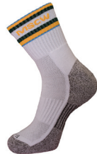
Sports Socks 2 pkt