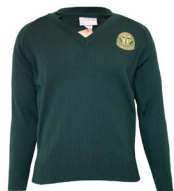
Pullover Yrs 7 - 9