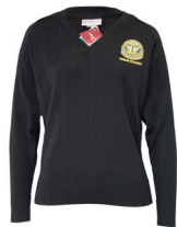
Pullover Yr 10 - 12