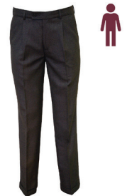
Trouser Pinhead Grey