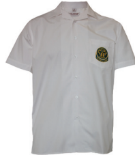
Shirt Short sleeve