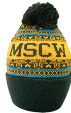
Beanie - NEW 2021