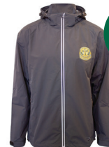
Jacket Wet Weather