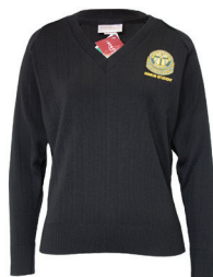
Pullover Yr 10 - 12