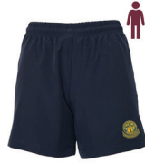
Sport Short unisex