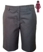
Tailored Shorts Charcoal Poly/wool