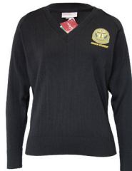
Pullover Yr 10 - 12