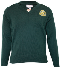
Pullover Yrs 7 - 9