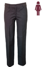
Pants Girls Charcoal Poly/wool