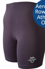
Sports Bike Short