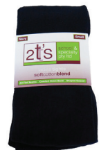
Tights Cotton Navy