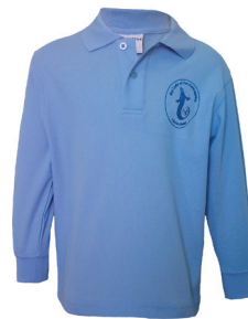
Polo Top Long Sleeve