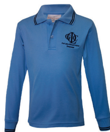
Polo Long Sleeve