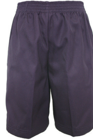
Shorts Pull On Gabardine Navy