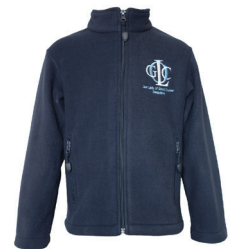
Polar Fleece Top