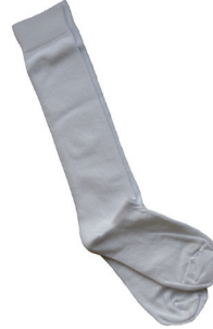
Kneehigh Cotton Rich