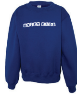
Oxley Kids Windcheater