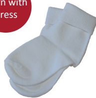
Sock White Turnover