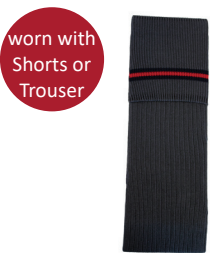
Sock Kneehigh stripe