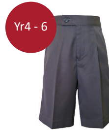
Shorts Elastic Back