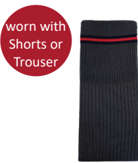
Sock Anklet stripe