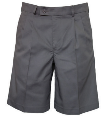
Shorts Pleat Front