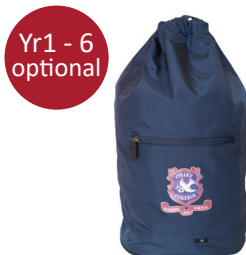
Havasak Sports Bag