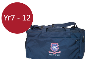
Olympic Sports Bag