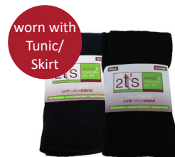
Tights Navy or Black