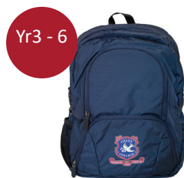
Airopak Schoolbag MED