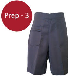
Shorts Pull On