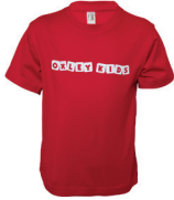
Oxley Kids T Shirt