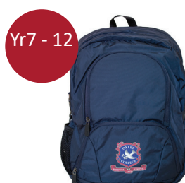
Airopak Schoolbag LRG