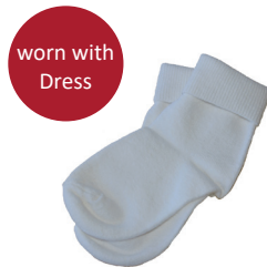
Sock White Turnover