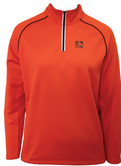
Track Top 1/4 Zip