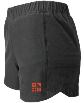
Sport Shorts with Inner