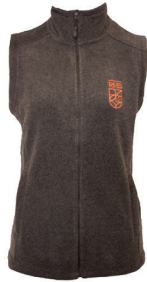
Polar Fleece Vest