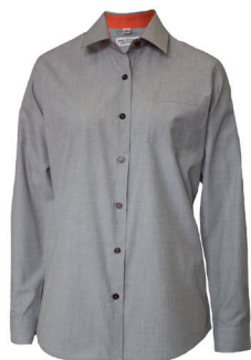
Blouse Long Sleeve