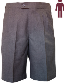
Shorts Senior Pleated