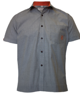
Shirt Short Sleeve