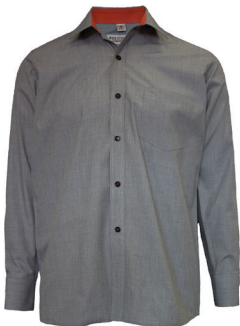
Shirt Long Sleeve