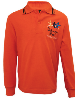
Polo Long Sleeve