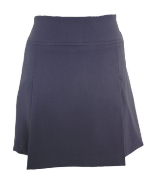
Sports Skort Navy