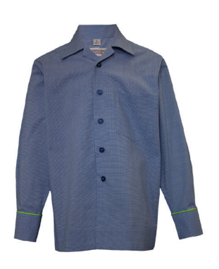
Long Sleeve Shirt