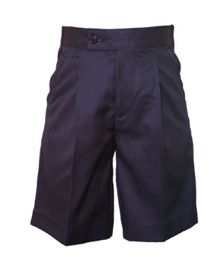
Shorts elastic back Navy