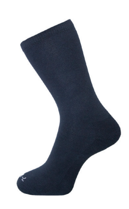
Socks Crew Navy 3pk