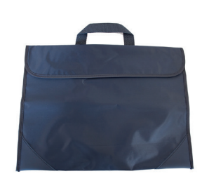
Library Book Bag