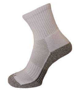
Sports Sock 2 pkt