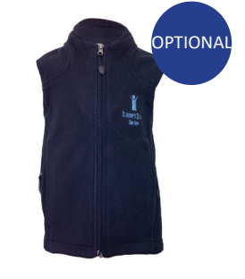
Polar Fleece Vest