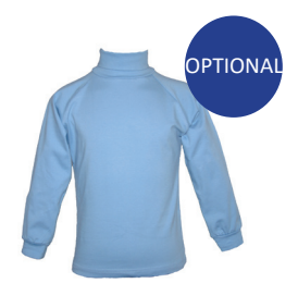
Skivvy Sky Blue