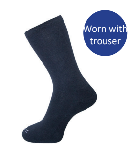
Socks Crew Navy 3 pkt