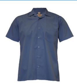
Shirt Short Sleeve Blue