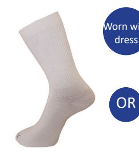
Socks Anklet 2 pkt