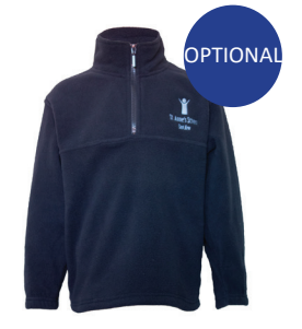
Polar Fleece Top