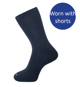
Socks Crew Navy 3 pkt