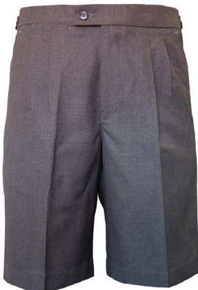
Shorts Pleat Front