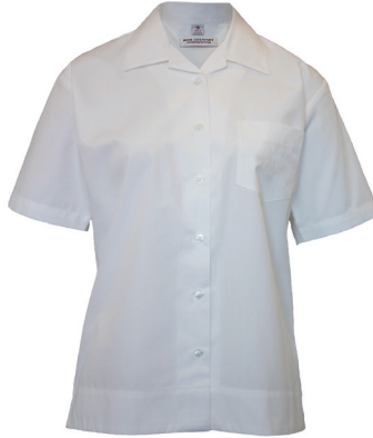
Blouse Short Sleeve