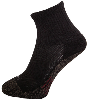
Socks Black Sports 2pkt