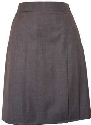
Skirt with Pinstripe