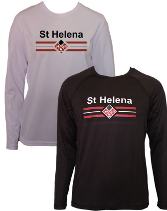
Long Sleeve Active Tee