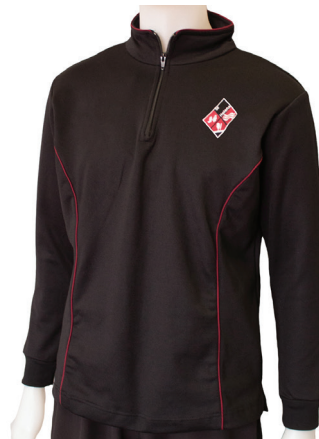
Top with Qtr Zip