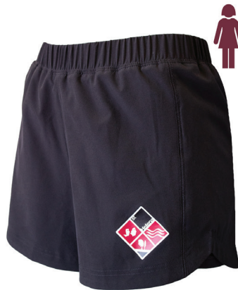
Sport Shorts with Inner