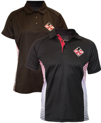
Active Polo - Regular & Fitted styles available