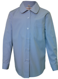
Blouse Peter Pan