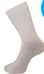
Socks White 2 pkt