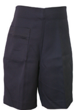
Shorts Pullon Navy