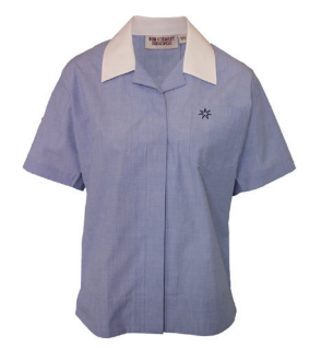
Short Sleeve Blouse