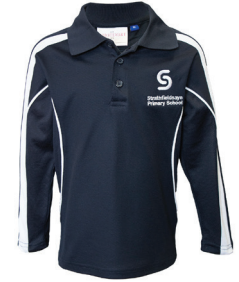
Polo Long Sleeve