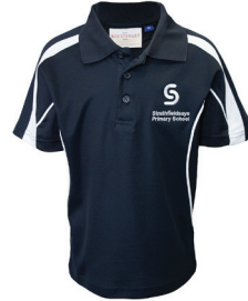
Polo Short Sleeve