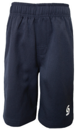
Shorts - Gabardine