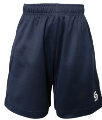
Shorts - Sportsmesh