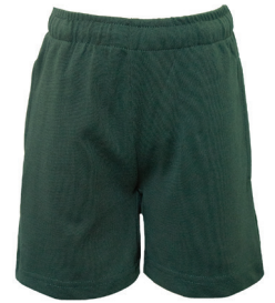
Shorts Knit Elastic waist