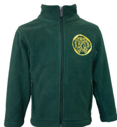
Polar Fleece Jacket