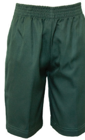
Shorts Gabardine Pull On