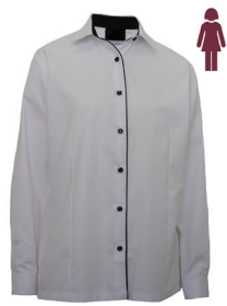
Long Sleeve Blouse