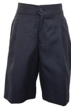
Junior elastic Shorts