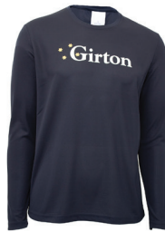
Training Top L/S