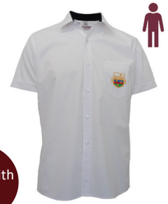
Short Sleeve Shirt