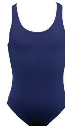
Bathers One Piece

For current prices, please refer to www.bobstewart.com.au