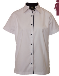
Short Sleeve Blouse