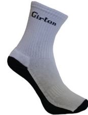
Sports Crew Socks