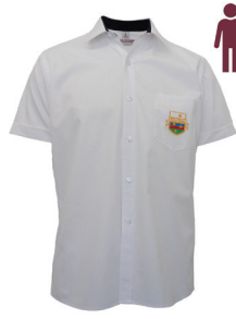
Short Sleeve Shirt