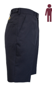
Senior pleated shorts