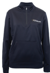
Polar Fleece Top