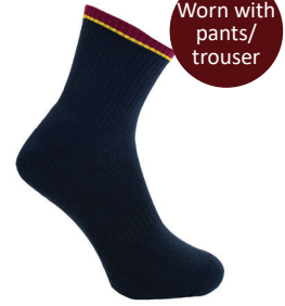
Navy sock with stripe