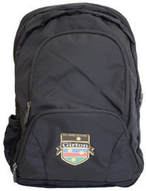
Airopak - 3 sizes