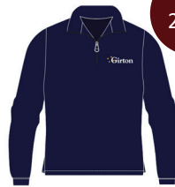
1/4 Zip Fleece Top