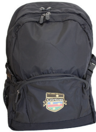
Chiropak - 3 sizes