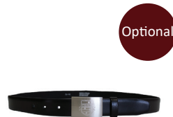
Belt with Girton Buckle

For current prices, please refer to www.bobstewart.com.au