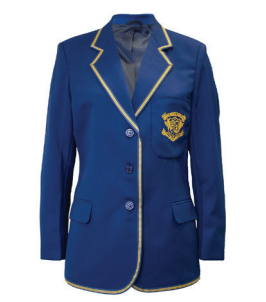
Blazer Braided Yr 11 & 12