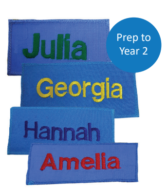
Pinafore Name Tag