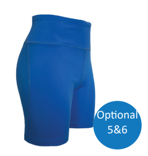
Short Sport Compression Athletics/Cross Country Gymnastics Training Triatholon