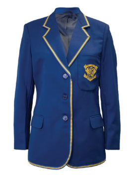
Blazer Braided Yr 11 & 12