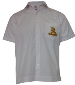
Short Sleeve Crested Shirt