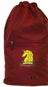
Havasak Sports Bag