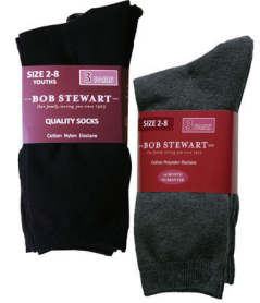
Sock Crew 3pk