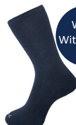
Navy Crew Sock 3pkt