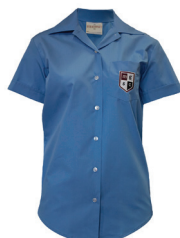
Short Sleeve Blouse