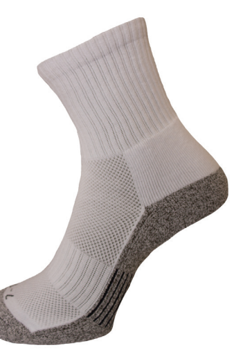
Sport Socks 2 pkt

PE/Sports Uniform for Year 3 to Year 12 please see page 7