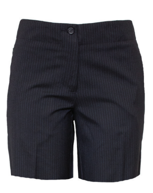
Tailored Shorts - Stripe