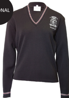
Year 12 Pullover