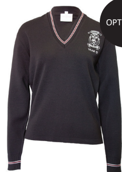
Year 12 Pullover