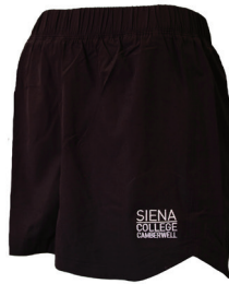
Sports Short with inner