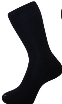
Socks Crew 3 pk