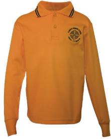
Sports Polo Long Slv