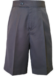
Shorts fly front elastic