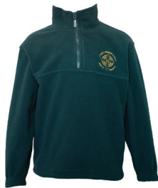
Polar Fleece Top