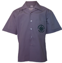
Shirt Short Sleeve