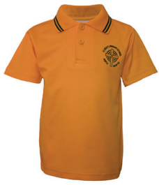
Sports Polo Short Slv