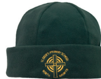
Polar Fleece Beanie