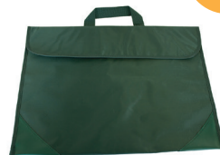
Library Book Bag