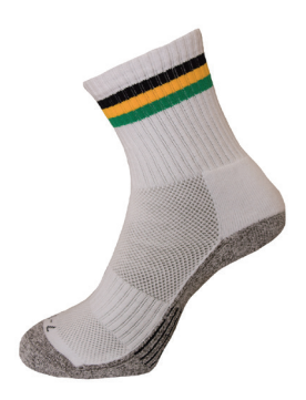
Sports Sock 2pk