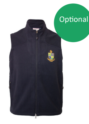
Polar Fleece Vest