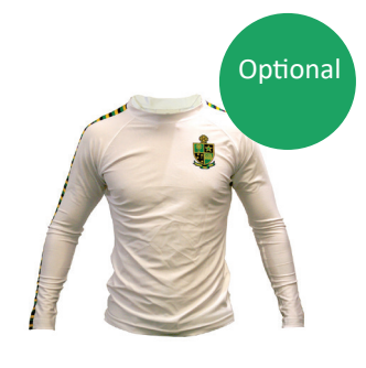
T Shirt Long Sleeve