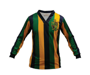
AFL Jersey Long Sleeve