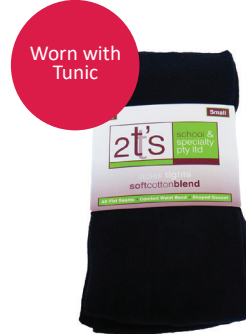
Worn with Tunic