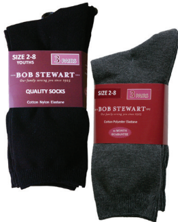
Socks Crew 3 pkt Black or Grey