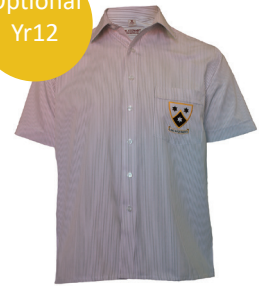
Stripe Shirt Short Sleeve

Yr 12 have the Option of White Short Sleeve Shirt worn with Tie OR Stripe Short Sleeve Shirt