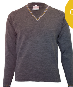
Pullover Yrs 7 to 9