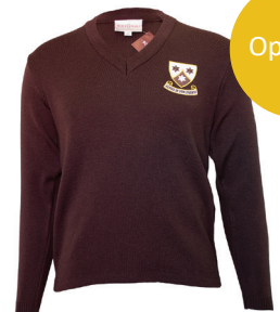
Pullover Yrs 10 to 12

For current prices, please refer to www.bobstewart.com.au