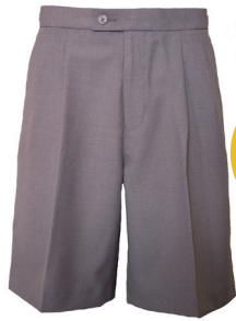
Shorts Senior Silver Grey