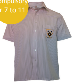
Stripe Shirt Short Sleeve