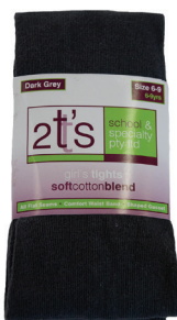
Tights Dark Grey