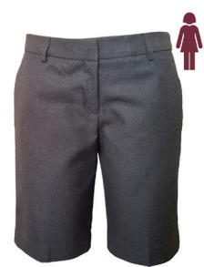
Shorts Tailored Dark Grey