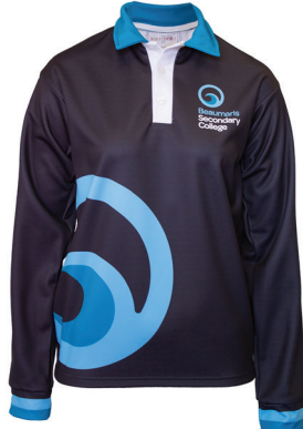
Sports Top Long Sleeve