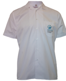
Short Sleeve Shirt with crest