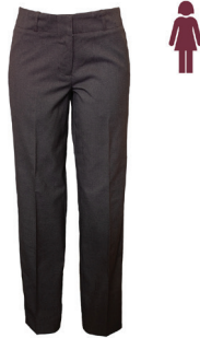
Pants Tailored Grey Melange