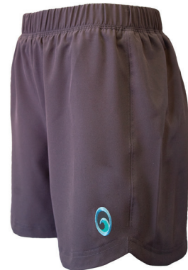
Sports Short with Inner