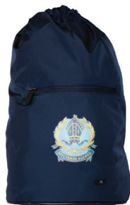
Havasak Sports Bag