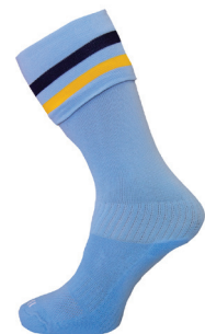
Sock Light Blue Sock Baseball, Futsal, Hockey, Soccer