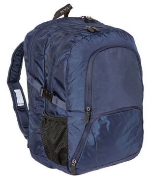
Airo Backpack Plain Navy

For current prices, please refer to www.bobstewart.com.au