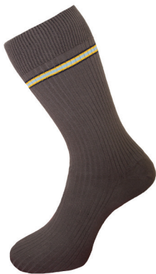
Sock Cotton Striped Crew Sock 2pkt