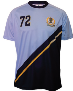
Sports Top with Number

Archery, Badminton, Fencing, Golf, Kayaking, Snow Sports, Squash, Swimming, Table Tennis, Taekwondo, Triathlon, Waterpolo