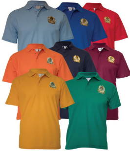
House Polo ( PE )