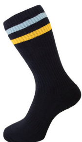
Crew Navy Sock Basketball, Golf, Volleyball