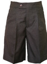
Shorts Pinhead elastic