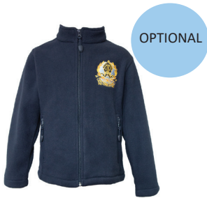
Polar Fleece Jacket