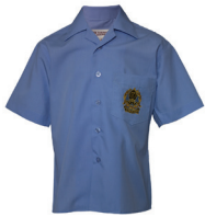
Shirt Short Sleeve with Crest