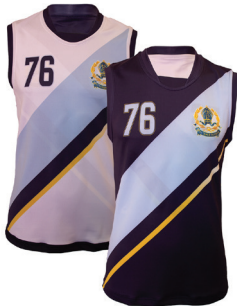
AFL Football Reversible

Cricket, Lawn Bowls, Tennis, Real Tennis Long Sleeve white polo available for Cricket & Lawn Bowls