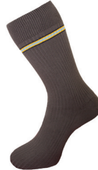
Sock Cotton Striped Crew Sock 2pkt