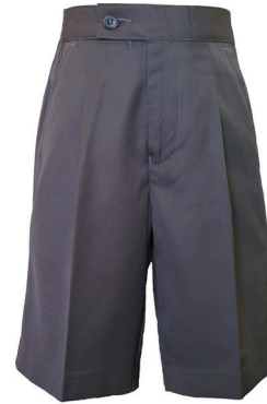
Short elastic back Grey