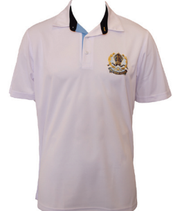
Sports Polo White

Cricket, Lawn Bowls, Tennis, Real Tennis Long Sleeve white polo available for Cricket & Lawn Bowls