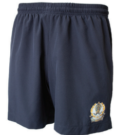
Sport Shorts - multi purpose