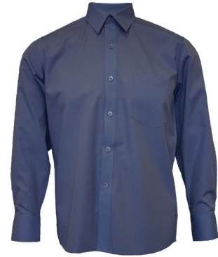
Shirt Long Sleeve Blue