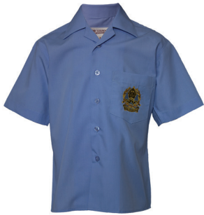
Shirt Short Sleeve Crested