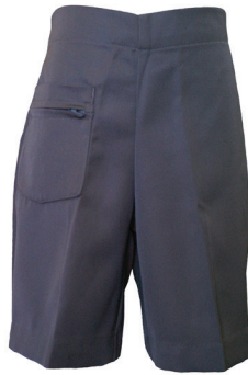
Shorts pull on Grey