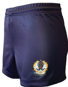
AFL Football Shorts