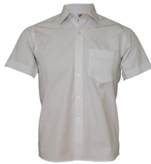
Shirt Short Sleeve White