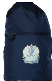
Havasak Sports Bag