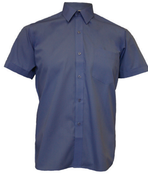
Shirt Short Sleeve Blue