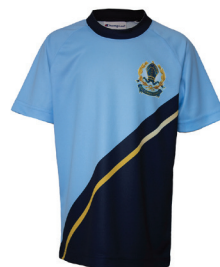
Junior Sports Top For Interschool Only

For current prices, please refer to www.bobstewart.com.au