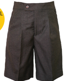
Shorts Primary Elastic

For current prices, please refer to www.bobstewart.com.au