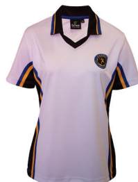
Sport Polo Tailored