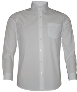
Blouse Long Sleeve