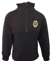
ELC Polar Fleece Top