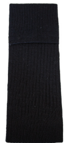
Socks Kneehigh Black

For current prices, please refer to www.bobstewart.com.au