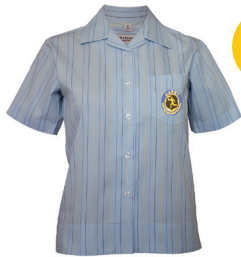
Tailored Shirt Short Sleeve