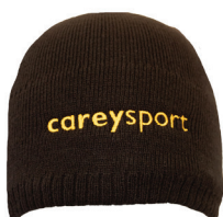
SUPPORTER ITEM Saturday Sport Only