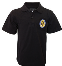
ELC Polo Top