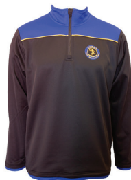
QTR Zip Fleece Top