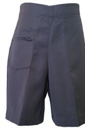
Pull on Shorts