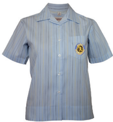
Tailored Shirt Short Sleeve