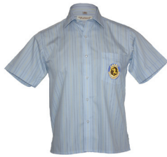
Classic Shirt Short Sleeve