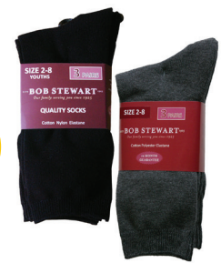
Sock Crew 3 pk