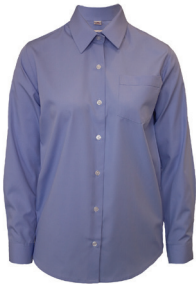
Blouse Long Sleeve