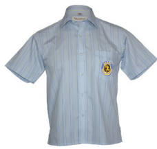
Classic Shirt Short Sleeve