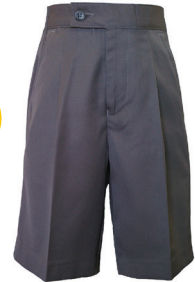
Junior Shorts w/elastic