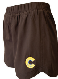
Sport Shorts with inner