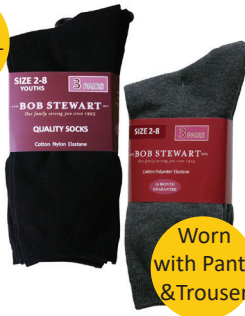
Socks Crew 3 pk