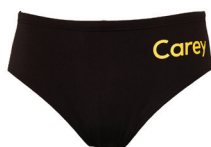
Bathers Speedo style