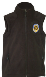
Polar Fleece Vest