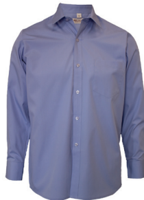
Shirt Long Sleeve