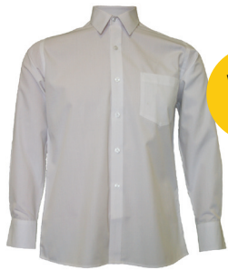
Shirt Long Sleeve