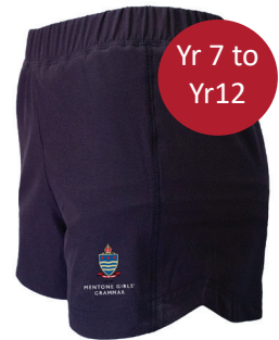
Sport Shorts w/winner