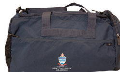
Sports Bag - Yr7-12