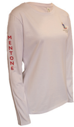
Long Sleeve Top