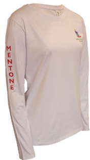
Long Sleeve Tee