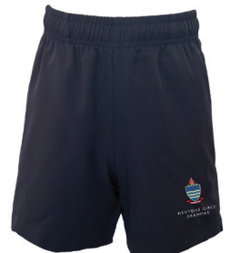
Junior Sport Shorts