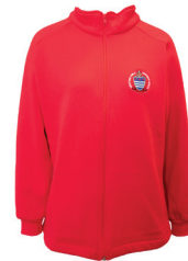
Fleecy Track Top