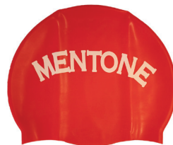
Swim Cap - school