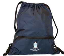
Gearsack - Prep - 6