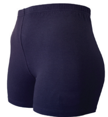
Bike Shorts - worn under dress