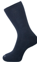
Socks Navy 3pkt