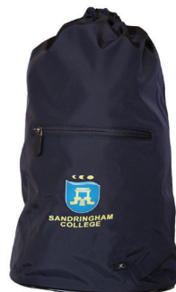
Soft Sports Bag