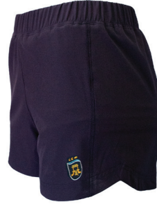
Sports Short w/inner