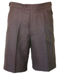
Shorts pleat front