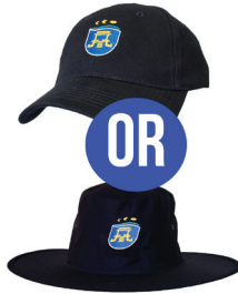
Cap OR Slouch Hat