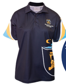
Sports Academy Polo

Sports Academy Students Only No Sports Polo required