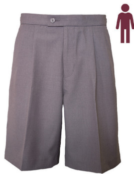
Shorts Senior Pleated