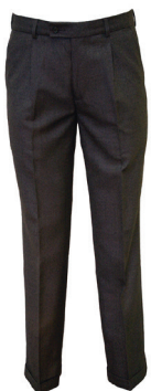
Trouser Pleat Front