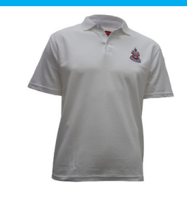
Cricket Polo Short Sleeve