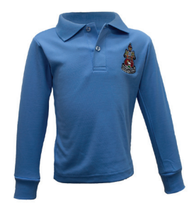
Polo Long Sleeve