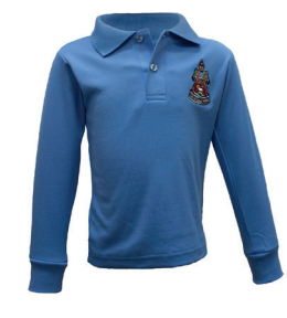
Sky Polo Long Sleeve