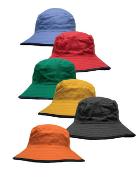
Bucket Hat Reversible