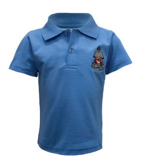
Polo Short Sleeve