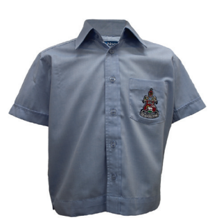
Short Sleeve Shirt