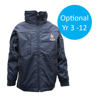
Coat with Crest