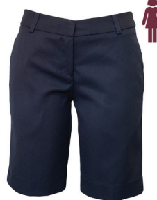
Shorts Tailored Navy