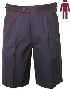
Shorts Pleated Front Navy