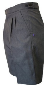
Shorts Senior with crest