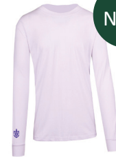
Long Sleeve Tee