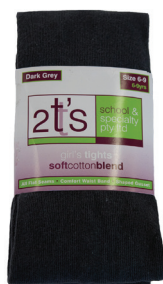
Tights Dark Grey Cotton