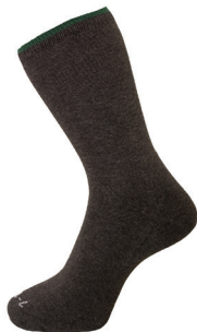
Socks Grey 2 pkt with green tipping