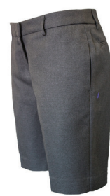
Shorts Tailored with crest