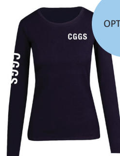
Long Sleeve Tee

For current prices, please refer to www.bobstewart.com.au