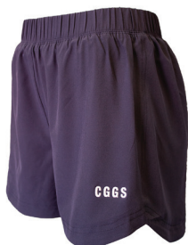
Sports Short with Inner