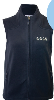
Polar Fleece Vest