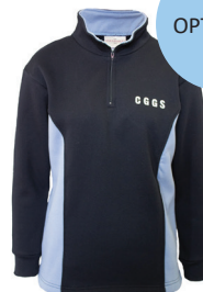
Top Qtr Zip