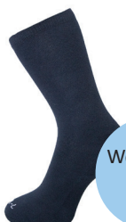
Socks Navy Crew 3pk