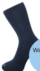
Socks Navy Crew 3pk