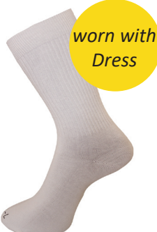
Anklet Sock 2 pkt