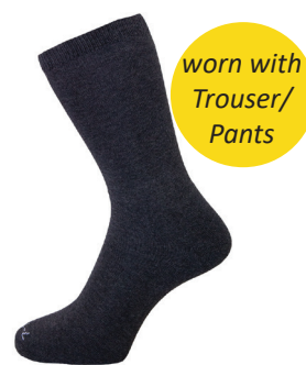
Sock Crew Grey 3pkt