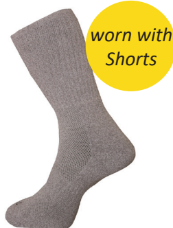
Short Walk Sock 2 pkt