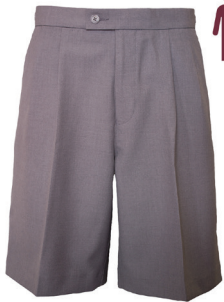
Shorts Senior Pleated