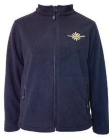
Polar Fleece Jacket