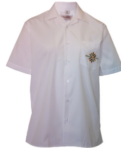
Shirt Short Sleeve