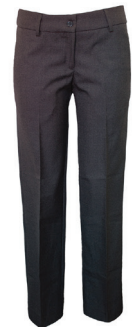
Pants Tailored Pinhead