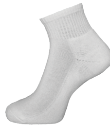
Sock Sport 2 pkt